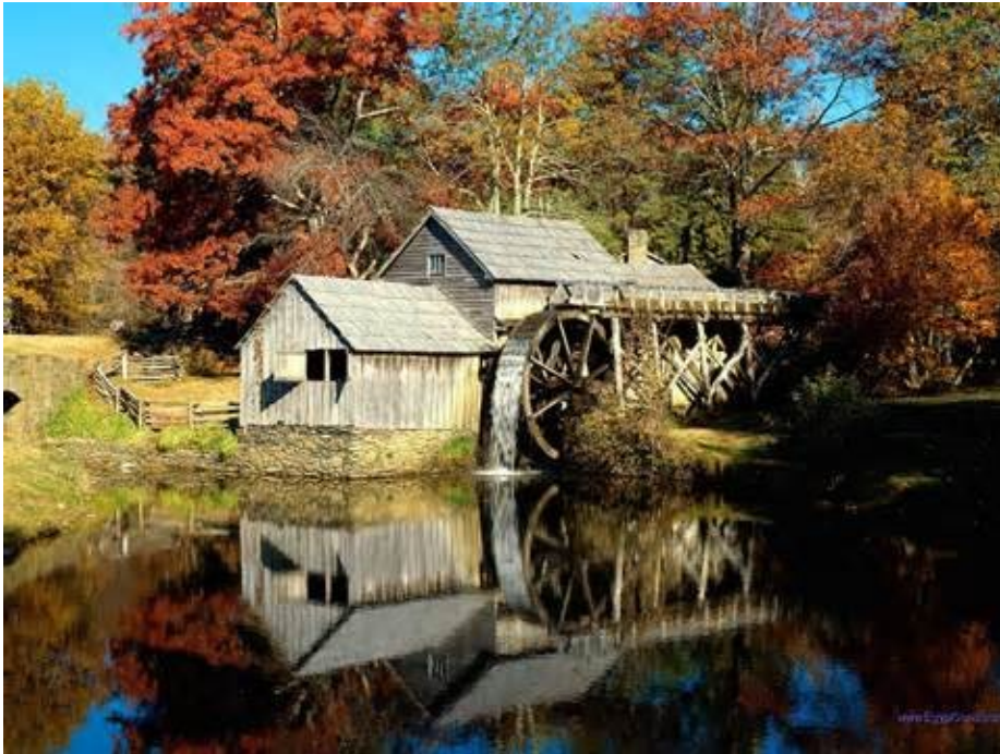
MABRY MILL ON PARKWAY