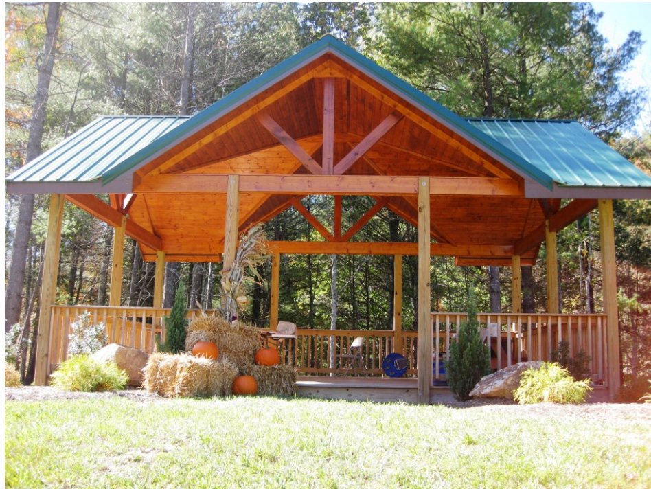
FALL HARVEST TIME