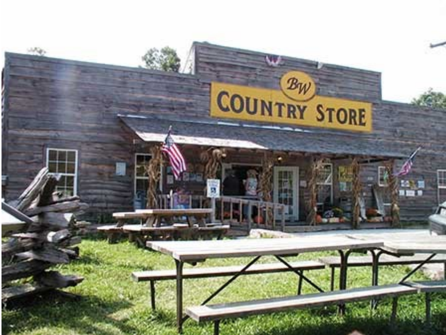
WYTHEVILLE AREA 20 MINUTES