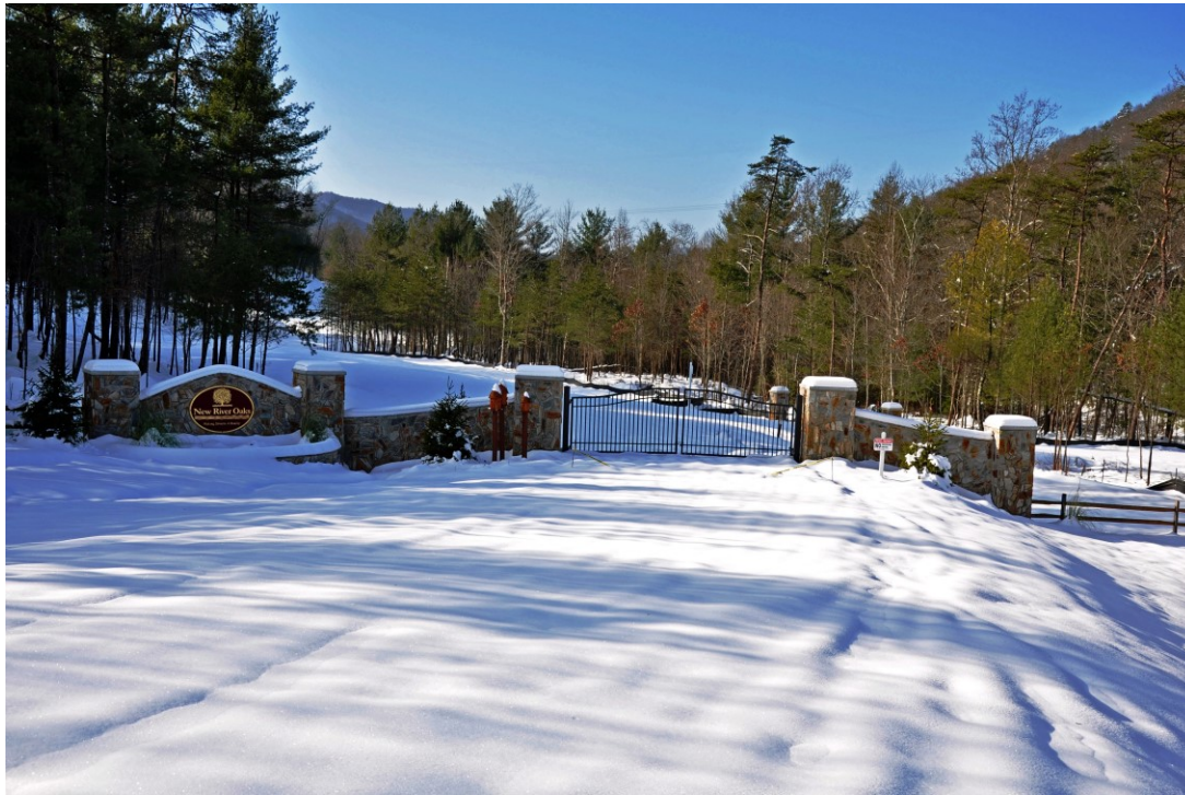
SECURE GATED ENTRY