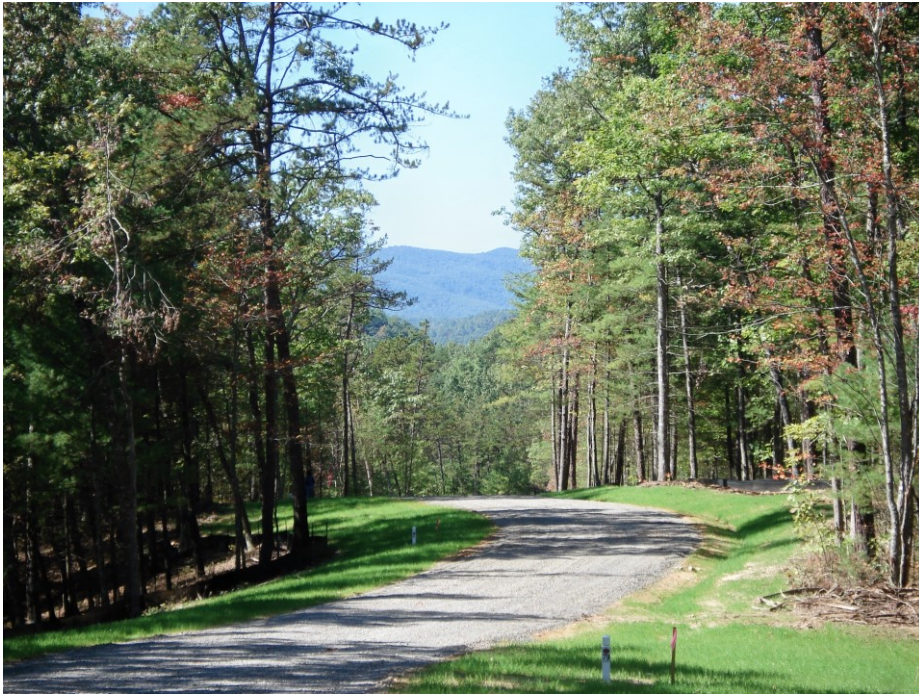
LUSH NATURAL LANDSCAPE