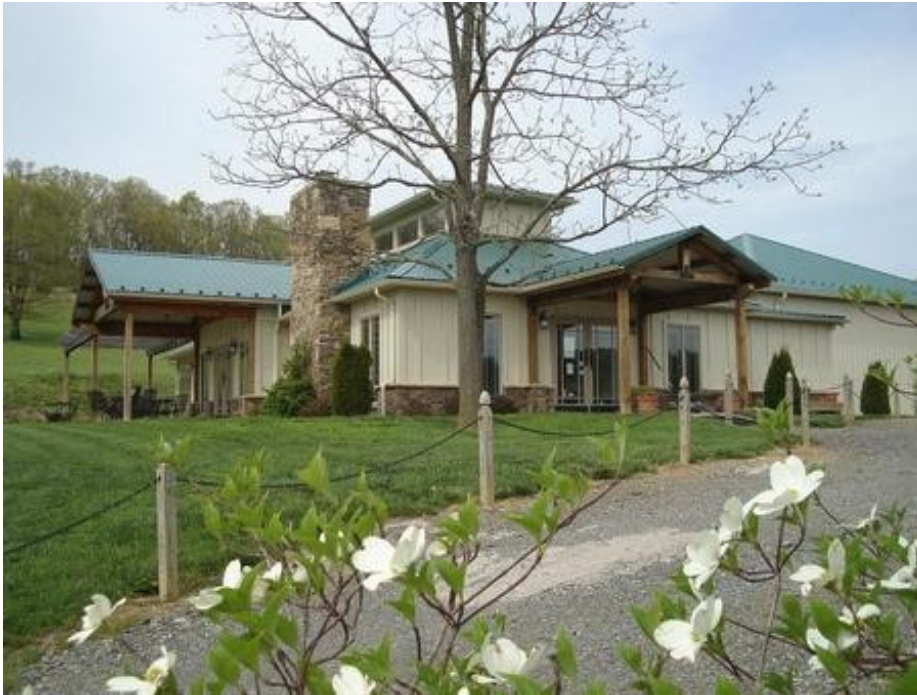
WEST WIND WINERY 5 MINUTES FROM NRO