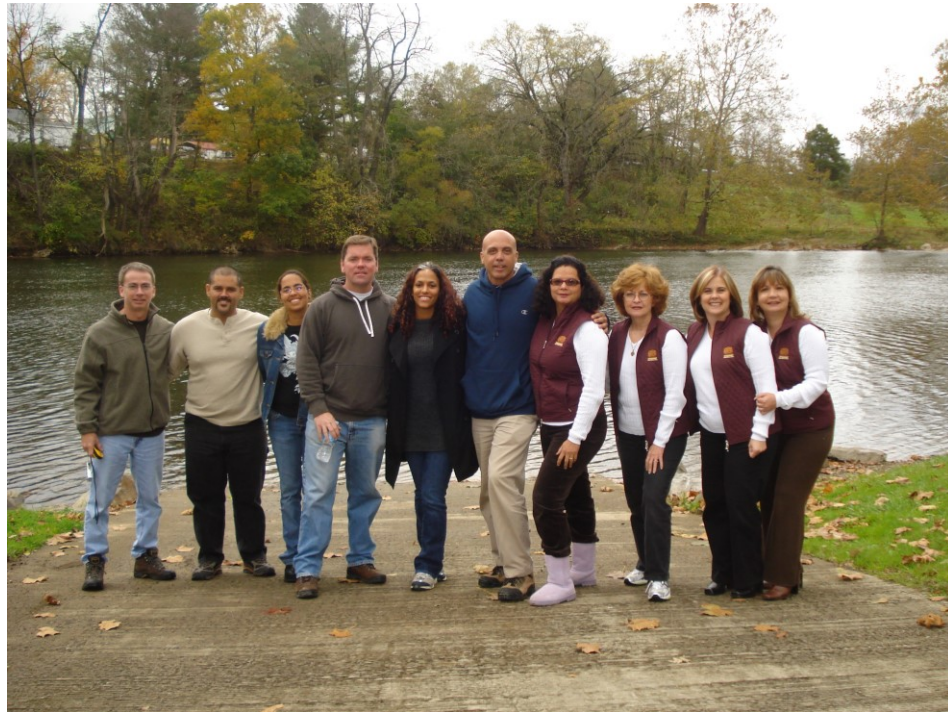
GROUPS ON THE NEW RIVER