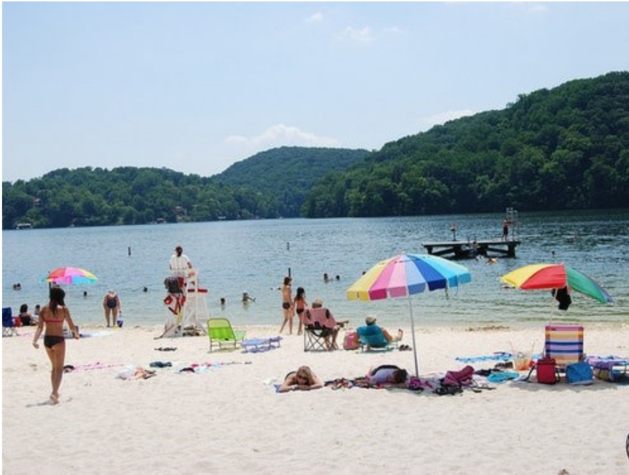
CLAYTOR LAKE STATE PARK